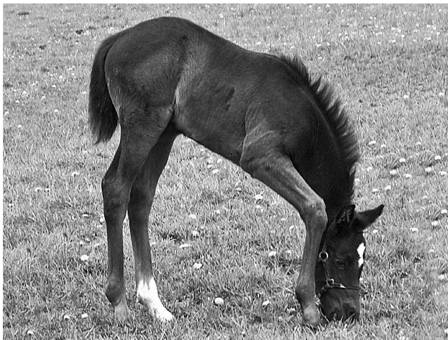
Horses evolved as continuous grazers of forage, consuming large quantities of “fresh” grass pasture every day. Fat/oil is in everything the horse eats naturally. Forages will average between five percent fat/oil in immature pasture grasses, to one percent fat/oil in over-mature grass hay. Shown above is the 2007 filly Fleurette (Fabuleux-Fun Choice xx/Don’s Choice xx) owned and bred by Kris Schuler, Pa.

Don’t overlook the fact that “good” quality, immature forages (hay and pasture with a Relative Feed Value above 103) can and will provide a significant amount of calories to young growing horses, nursing mares and horses in training.